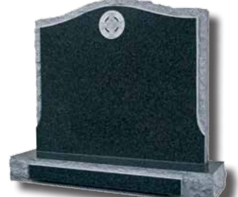
A LARGER MEMORIAL HAND CRAFTED IN A TRADITIONAL STYLE. THIS IS A DOUBLE WIDTH MEMORIAL IN DARK GREY GRANITE. THE EDGES HAVE A RUSTIC FINISH AND THE FACE IS POLISHED WITH A RUSTIC MARGIN. DEEP HAND CARVED CELTIC KNOT WORK IS SHOWN AT THE TOP.