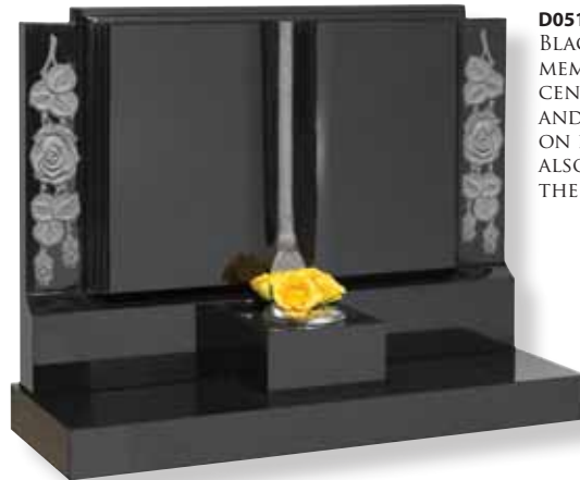
D051 BLACK GRANITE BOOK MEMORIAL WITH CARVED CENTRE CORD AND TASSEL, AND CARVED ROSE DESIGNS ON EITHER SIDE. THERE IS ALSO A RECTANGULAR VASE ON THE CENTRE OF THE BASE.