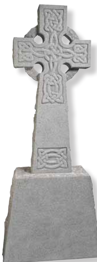
D045 TRADITIONAL HAND CRAFTED CELTIC CROSS IN LIGHT GREY GRANITE WITH DEEP CARVED CELTIC KNOT WORK. THE LARGE BASE AREA GIVES AMPLE SPACE FOR THE INSCRIPTION. THIS MEMORIAL IS INDIVIDUALLY HAND CRAFTED AND IS AVAILABLE IN A VARIETY OF DESIGNS AND SIZES.