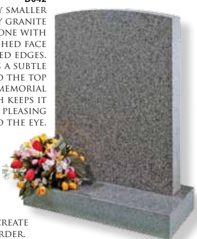
D042 A SLIGHTLY SMALLER LIGHT GREY GRANITE HEADSTONE WITH A POLISHED FACE AND SANDED EDGES. THERE IS A SUBTLE CURVE TO THE TOP OF THE MEMORIAL WHICH KEEPS IT SIMPLE BUT PLEASING TO THE EYE.