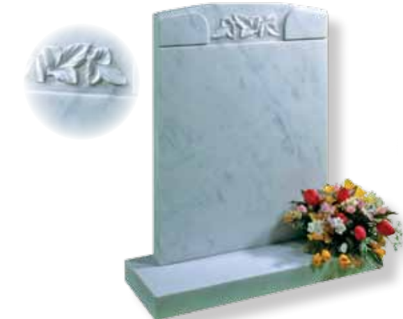
D035 MEMORIAL IN WHITE CARRARA MARBLE WITH BEAUTIFUL CARVED LEAF DESIGN AT THE TOP.