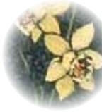
D030 BARREL SIDED DARK GREY GRANITE WITH RUSTIC EDGES AND POLISHED FACE. SHOWN WITH DAFFODIL ETCHED DESIGN ON BOTH SIDES.