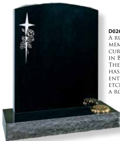
D026 A RUSTIC EDGED MEMORIAL WITH A CURVED TOP SHOWN IN BLACK GRANITE. THE POLISHED FACE HAS A SIMPLE CROSS ENTWINED WITH AN ETCHED OUTLINE OF A ROSE.