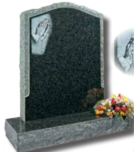
D061 ONE OF OUR TRADITIONAL HAND CRAFTED MEMORIALS IN DARK GREY GRANITE. THIS EXAMPLE SHOWS THE HEADSTONE WITH A DESIGN OF PRAYING HANDS. THE EDGES HAVE A RUSTIC FINISH AND THE FACE IS POLISHED WITH A RUSTIC MARGIN.

ALL POLISHED CALEDONIAN GREEN GRANITE MEMORIAL WITH PROMINENT CELTIC CROSS TO THE LEFT MAKING THIS VERY DISTINCTIVE BOTH WITH REGARD TO THE SHAPE AND ALSO THE COLOUR. THIS MEMORIAL REQUIRES LITTLE IN THE WAY OF MAINTENANCE.