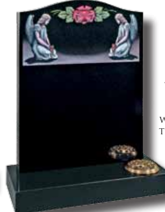
D027 THIS MEMORIAL IS ONE OF OUR ALL POLISHED BLACK GRANITE RANGE, WHICH REQUIRES LITTLE IN THE WAY OF MAINTENANCE. THE VERSATILITY OF THIS RANGE MEANS A MORE PERSONAL TRIBUTE CAN BE MADE AND A WIDE CHOICE OF ORNAMENTAL ETCHINGS AND CARVINGS ARE AVAILABLE TO SUIT. THE DESIGN SHOWN IS OF TWO ANGELS WITH A ROSE BETWEEN, ETCHED AT THE TOP OF THE HEADSTONE.