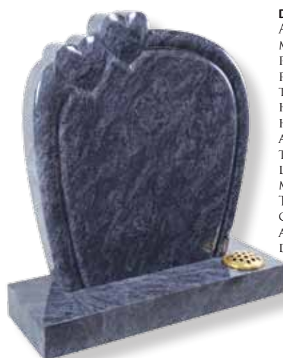
D041 A BEAUTIFULLY SHAPED MEMORIAL WITH A POLISHED GROOVE RUNNING AROUND THE OUTSIDE OF THE HEADSTONE AND TWO HEARTS AT THE TOP. WITH AN ALL POLISHED FINISH THIS HEADSTONE REQUIRES LITTLE IN THE WAY OF MAINTENANCE. THE BAHAMA BLUE GRANITE MAKES THIS A VERY UNUSUAL AND DISTINCTIVE HEADSTONE.

THIS MEMORIAL IS ONE OF OUR ALL POLISHED BLACK GRANITE RANGE, WHICH REQUIRES LITTLE IN THE WAY OF MAINTENANCE. THE VERSATILITY OF THIS RANGE MEANS A MORE PERSONAL TRIBUTE CAN BE MADE AND A WIDE CHOICE OF ORNAMENTAL ETCHINGS AND CARVINGS ARE AVAILABLE TO SUIT. THIS EXAMPLE SHOWS A DOVE OF PEACE AT THE TOP CENTRE.