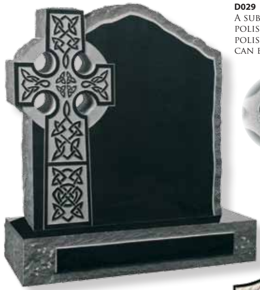
D029 A SUBSTANTIAL MEMORIAL IN BLACK GRANITE WITH POLISHED FACE AND RUSTIC EDGES. THE BASE HAS A POLISHED TOP AND POLISHED FRONT PANEL WHICH CAN BE USED FOR A FAMILY NAME.