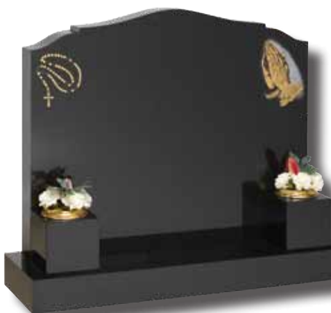
D056 THIS MEMORIAL IS ONE OF OUR ALL POLISHED BLACK GRANITE RANGE, WHICH REQUIRES LITTLE IN THE WAY OF MAINTENANCE. A WIDER THAN AVERAGE MEMORIAL THIS WOULD NORMALLY BE PLACED OVER TWO LAIRS. THERE IS A STEPPED EDGE TO THE TOP CURVE OF THE MEMORIAL AND TWO CUBE VASES AT EACH SIDE. TWO ETCHED DESIGNS ARE SHOWN IN THIS EXAMPLE.