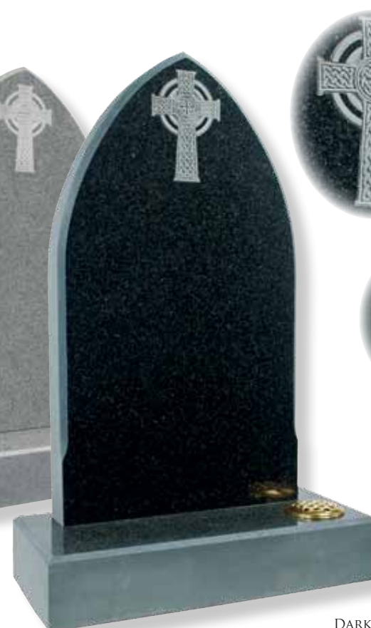
D006 DARK GREY PART POLISHED FINISH