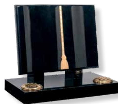
D059 AN ALL POLISHED BLACK GRANITE BOOK MEMORIAL WHICH REQUIRES LITTLE IN THE WAY OF MAINTENANCE. THE BOOK IS MOUNTED ON RESTS AND SITS ON ITS OWN BASE. A GILDED CORD AND TASSEL RUNS DOWN BETWEEN THE TWO PAGES. THE PAGES THEMSELVES BEING SHAPED AND CURVED.