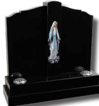
DESIGN ON CENTRE PILLAR CAN BE VARIED. DOUBLE BASE SHOWN IS OPTIONAL.