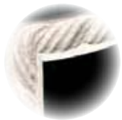
D044 WITH A VERY DISTINGUISHED ROPE EFFECT AROUND THE EDGE OF THE HEADSTONE, THIS IS AN OTHERWISE ALL POLISHED BLACK GRANITE MEMORIAL.