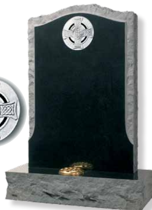
D002 TRADITIONAL HAND CRAFTED MEMORIAL SHOWN IN BLACK GRANITE WITH DEEP HAND CARVED CELTIC KNOT WORK. THE EDGES HAVE A RUSTIC FINISH AND THE FACE IS POLISHED WITH A RUSTIC MARGIN.

A GOTHIC SHAPED MEMORIAL, AVAILABLE IN EITHER GRANITE OR SANDED YORKSTONE. THE GRANITE HEADSTONES HAVE A POLISHED FACE WITH SANDED EDGES. SHOWN WITH DEEP HAND CARVED CELTIC KNOT WORK.