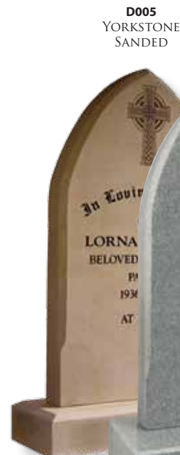
D005 YORKSTONE SANDED